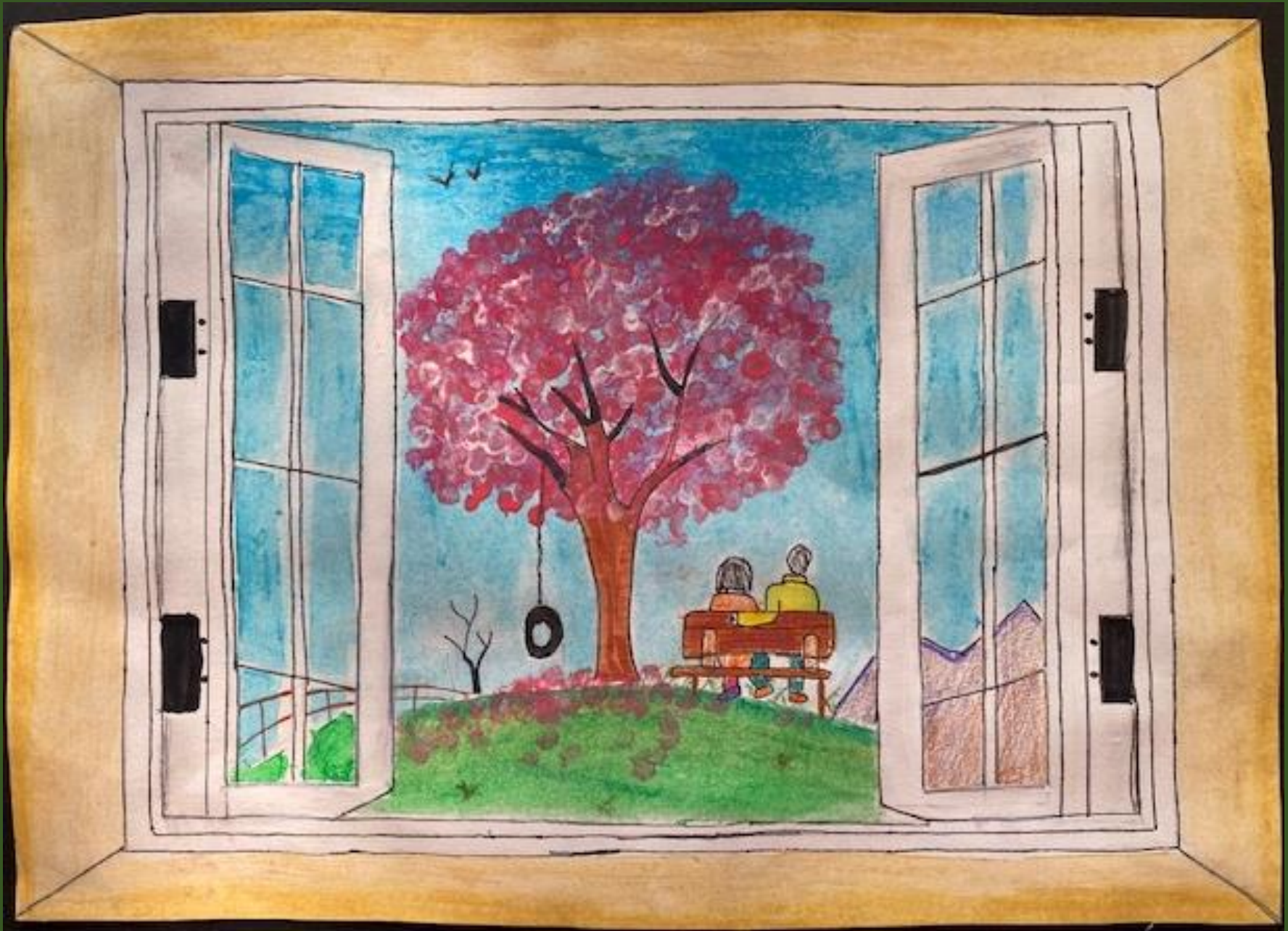
West Windsor Arbor Day Art Contest – 2023 6 th - 8 th Grade– First Place by Vivaan D.