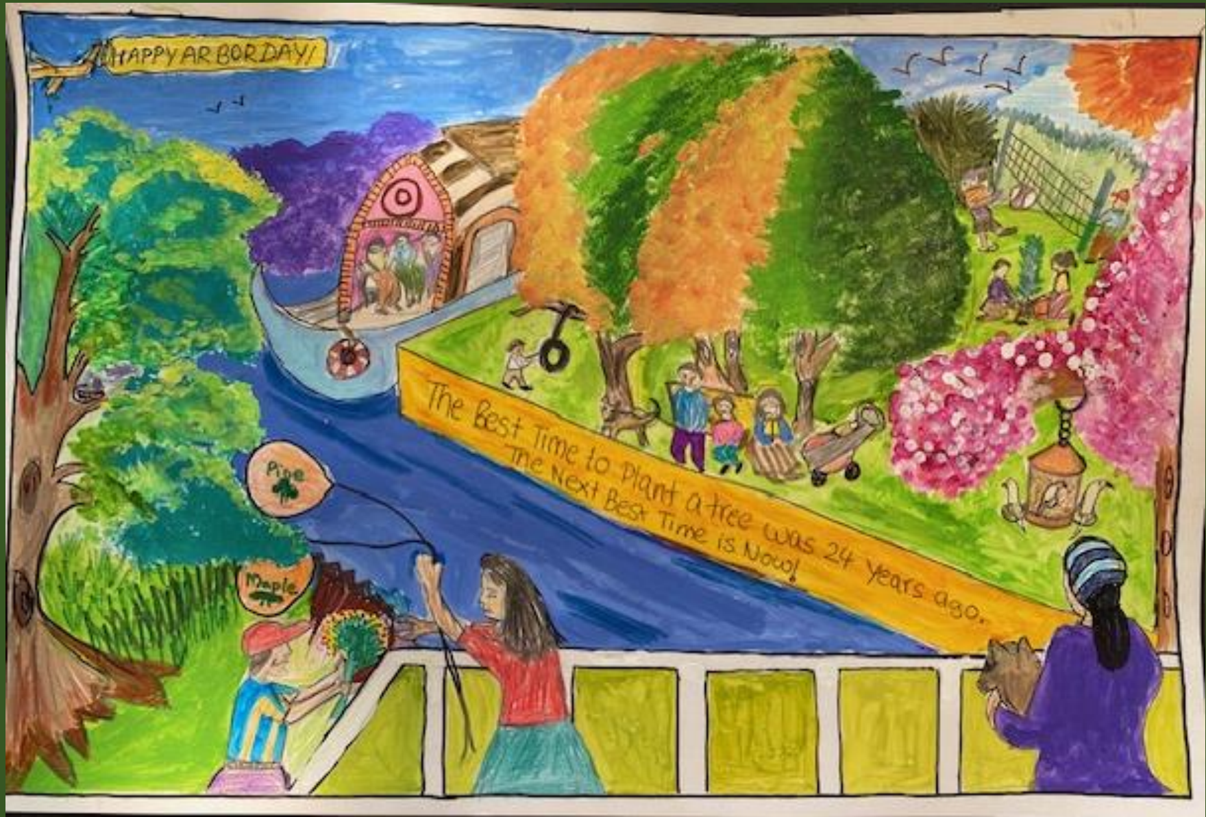
West Windsor Arbor Day Art Contest – 2023 9 th - 12 th Grade – Third Place by Tarikka A.