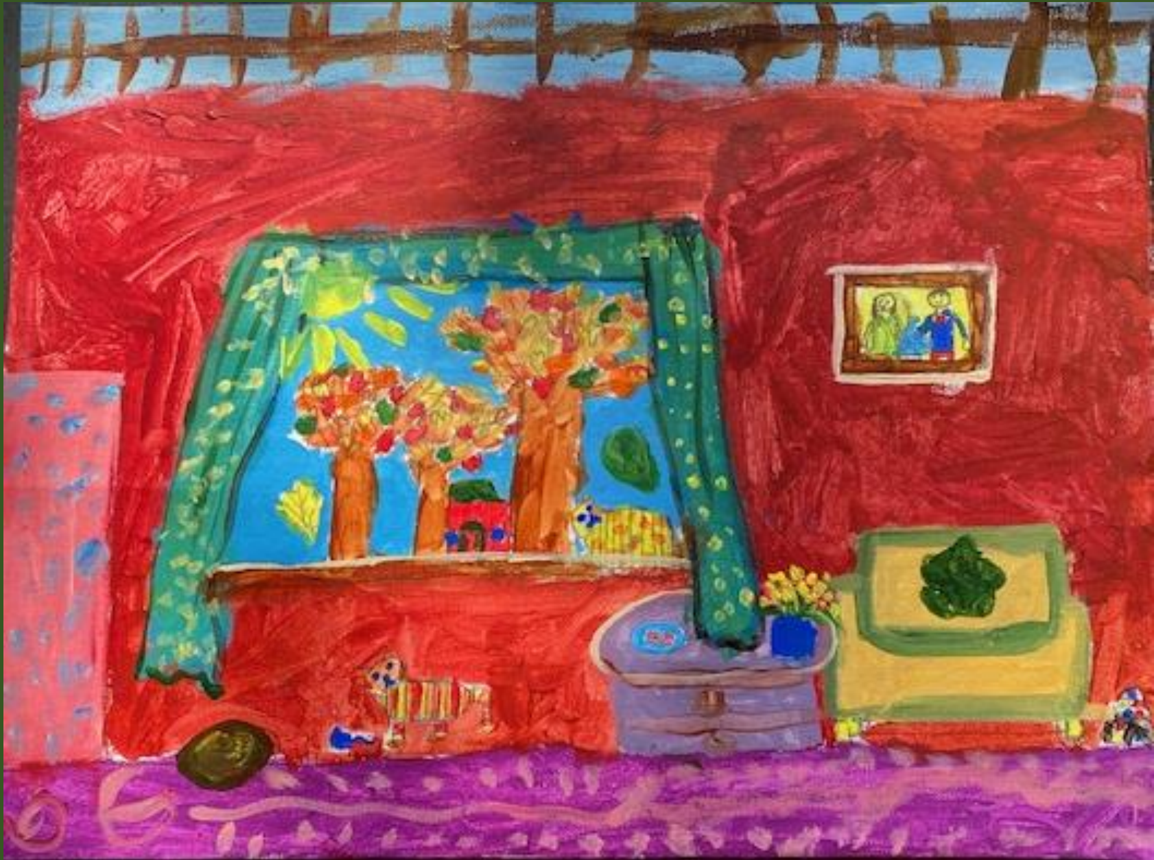
West Windsor Arbor Day Art Contest – 2023 K- 3rd Grade – First Place by Ada D.