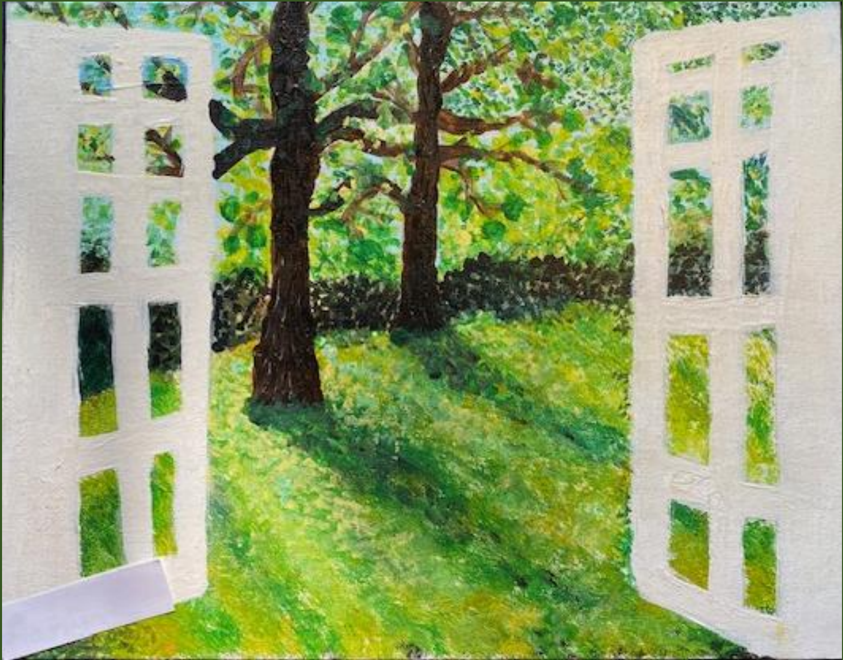
West Windsor Arbor Day Art Contest – 2023 4 th - 5 th Grade – First Place by Aanya K.