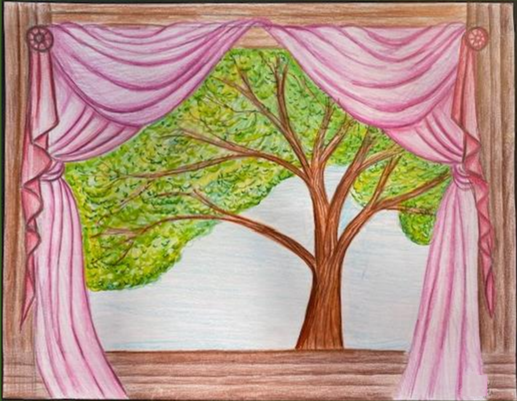
West Windsor Arbor Day Art Contest – 2023 9 th - 12 th Grade – First Place by Shruthi R.