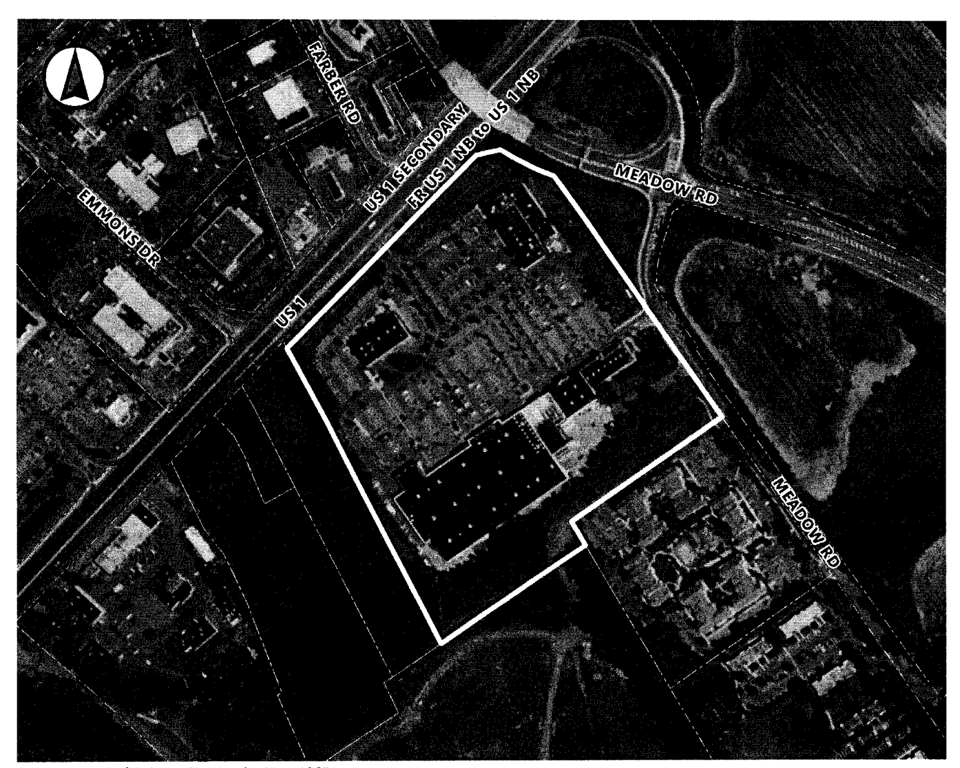
Map 1: Aerial of Subject Site (scale: 1" = 400')

https://burgis.sharepoint.com/sites/BurgisData/Shared Documents/W-DOCS/PUBLIC/Pb-3700series/Pb-3789.04/Planning Board/3789.04 SQ at West Winsor - Starbucks Drive Thru Planning Board Review 01 (PB 21-01).docx